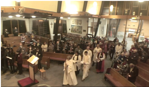
The procession at the beginning of the Commissioning Service